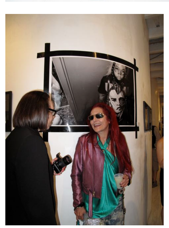
The-Nexus's blog Login or register to post